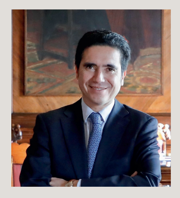
Ignacio Briones Rojas Minister of Finance

The government hopes that financial institutions will take into account and manage the climate dimension in decision-making, thereby carrying out their social role to assign capital efficiently whilst at the same time facilitating the transition to a sustainable, low-carbon economy."